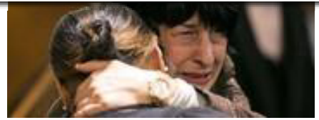
Aaron Hernandez's mom: I shared bond with victim's mother