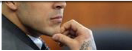
Lawyer: Aaron Hernandez, now in prison, low on cash