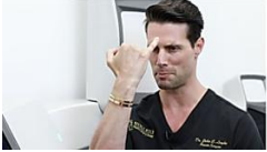
Plastic Surgeon Reveals: "You Can Fill In Wrinkles At Home" (Here's How) Health Headlines