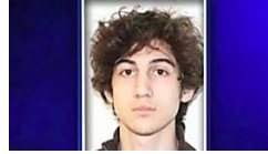
Boston marathon bomber's handwritten hospital notes released WHDH 7NEWS