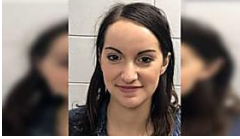
Police: Woman found passed out in car parked in middle of Wareham road WHDH 7NEWS