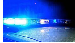
Police: 75-year-old woman shot grandson for putting cup of tea on table WHDH 7NEWS