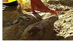
[Pics] Workers On A Texas Construction Site Unearth 95 Graves And Their Traveler Feed