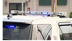
4-year-old boy shot, wounded in apparent case of road rage WHDH 7NEWS