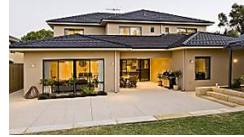
Government Pays To Renovate Your Home If You Live Near Wakefield (You) The Mortgage Savers