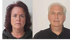
Police: Couple kept girl in small basement room with alarm WHDH 7NEWS