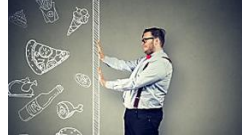
Type 2 Diabetes? Get Help Pushing Back With a Once-Daily Pill AstraZeneca