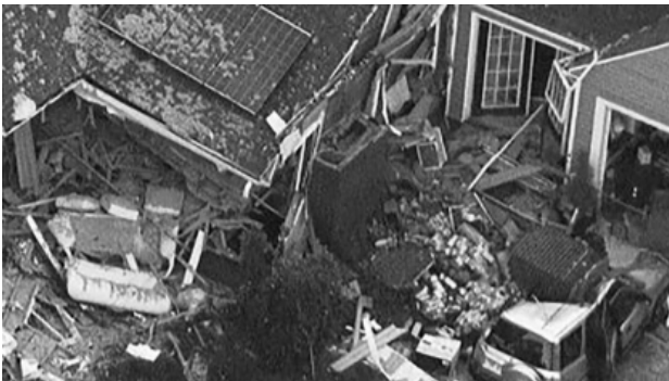
A home on Chickering Road in Lawrence exploded Sept. 13, 2018. The chimney crushed an SUV, killing Leonel Rondon.

Their lawsuit holds the utility responsible for "substantial personal injury and profound pain and suffering they are experiencing," their attorney said in September.