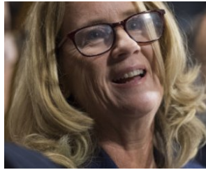
Ford Friend Told FBI She Was Pressured Into Altering StatementNypost.com