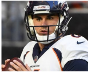
Broncos Cut QB After Alleged Fights at Von Miller PartyNypost.com