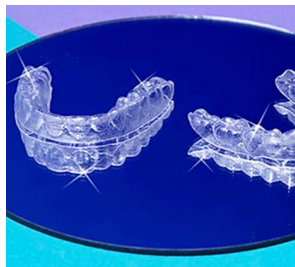
Don't want to pay up to $7k for braces? Straighten your teeth for 60% less. SmileDirectClub