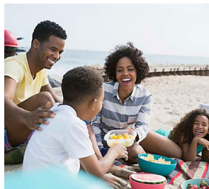
Maintain Your Family Estate's Wealth With These 3 Key Points BNY Mellon Wealth Management