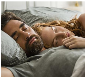
Ever Fallen in Love With a Mattress? You Might With This One Tuft & Needle