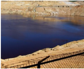
This Montana Tourist Trap Is One of Earth's Most Toxic PlacesWeather.com