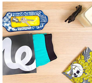
Refresh Your Undie Drawer With Awesome Undies and Save With Packs MeUndies