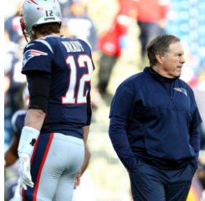
The Move That Kept Tom Brady from Divorcing Bill BelichickNypost.com