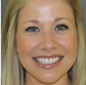
Teacher Who Smiled for Mugshot Pleads Guilty to Sex with StudentNypost.com