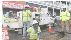
AG's office unhappy with Columbia Gas progress