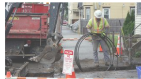
Columbia Gas deadline 'in jeopardy'