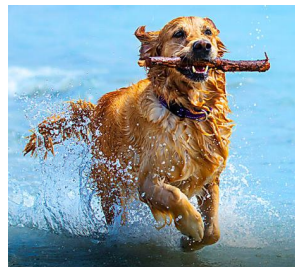
Can he bring you more years? Bayer