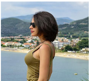
Could You be the Next Marijuana Millionaire? Strategic Tech Investor